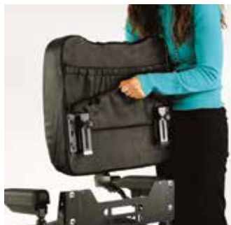
Back-Off easily removes back of mobility device to fit into shorter vehicle openings.