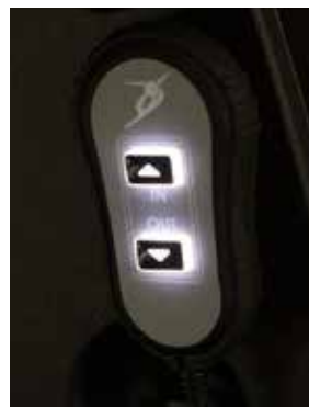
One button control with indicator light.