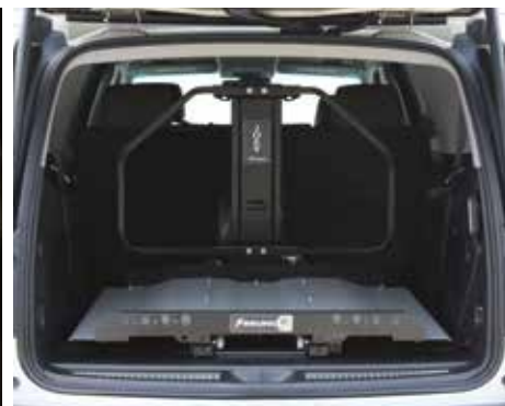
Industry-exclusive safety barrier. Protected by US Utility Patent No. 403.615