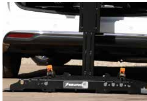
Belt kit* includes two retractable securement straps for added peace of mind. *Required in some vehicles