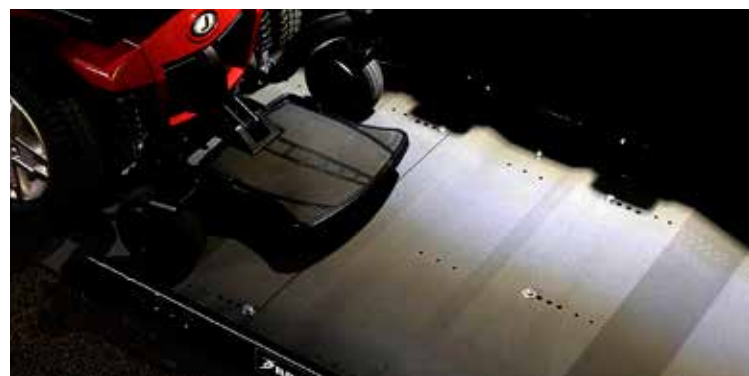
Platform illumination for night loading.